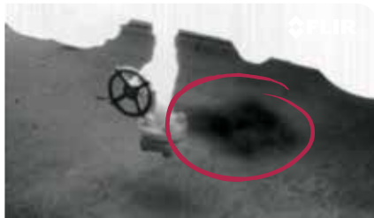
Captured gas leak from production site.

Benzene, Ethanol, Ethylbenzene, Heptane, Hexane, Isoprene, Methanol, MEK, MIBK, Octane, Pentane, 1-Pentene, Toluene, m-xylene, Butane, Methane, Propane, Ethylene and Propylene.