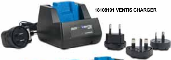
18108191 VENTIS CHARGER