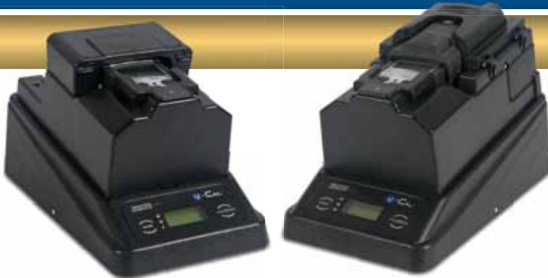
18108631-00 V-CAL WITH VENTIS INSTRUMENT* (*monitor not included)