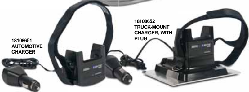
18108651 AUTOMOTIVE CHARGER