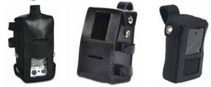
18108810 VENTIS WITH PUMP SOFT CARRYING CASE