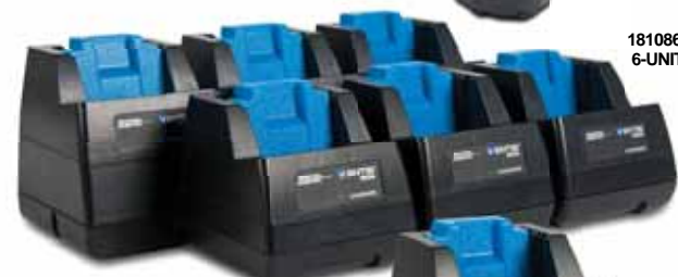
18108650-0 6-UNIT CHARGER