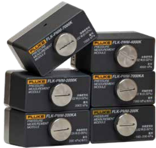
Figure 1. Rechargeable lithium battery with capacity indication.

HART communication enables mA output trim, trimmed to applied values, and pressure zero trimming of HART pressure transmitters. You can easily change a transmitter tag, measurement units and ranges. Other supported HART commands include setting fixed mA outputs for troubleshooting, reading device configuration parameters and reading device diagnostics.