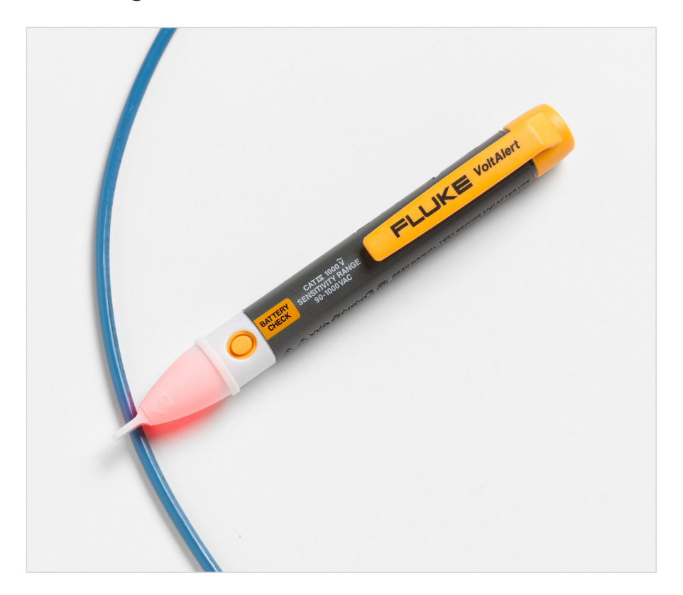
FLK2AC/90-1000V Fluke 2AC VoltAlert™Electrical Tester 90-1000V, straight tip for North American style outlets