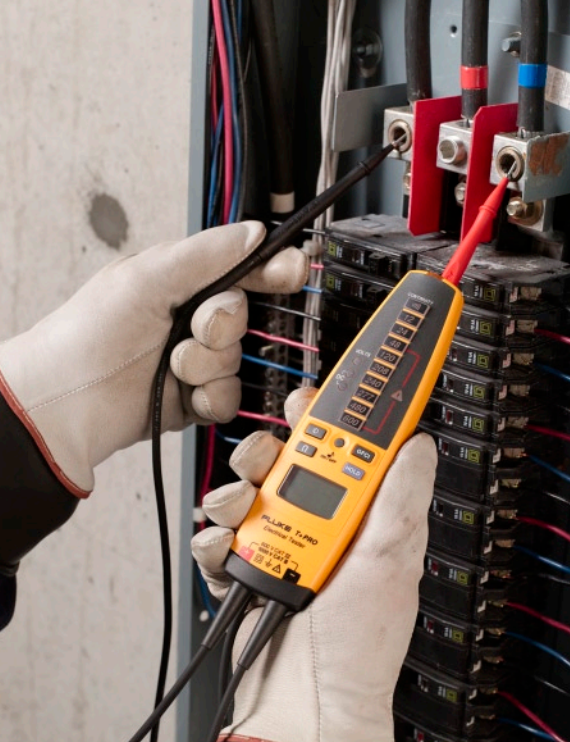
Electronic testers like this Fluke T+ vibrate, beep, and glow to indicate voltage, giving you the feel of an old-fashioned solenoid in a safer electronic model.

ability to measure higher voltages limits the capability to detect voltages below about 100 V due to the poor dynamic range of the magnetics, an unfortunate weakness of solenoid testers. Try using one on 24 V or 48 V control circuits, and you may as well be using a stick of wood.