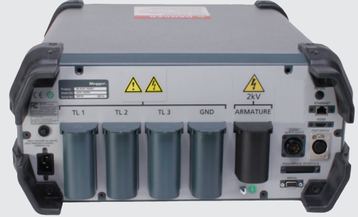
Back Panel connections for Ethernet, Power Pack Interface, HDMI, Serial port, Remote warning lights, E-Stop, and Footswitch