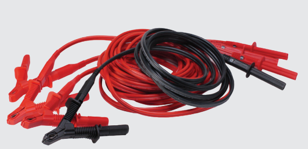
Detachable IEC61010-compliant combined HV / LV Kelvin test leads