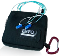
EF launch fiber (SPSB-EF-C30)

Whether for expanding enterprise-class businesses or large-volume data centers, new high-speed data networks built with multimode fibers are running under tighter tolerances than ever before. In the event of failure, intelligent and accurate test tools are needed to quickly find and fix the fault.