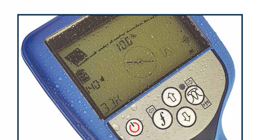
Built for on-site use - IP65

Shock resistant, ingress protected casing protects against knocks, drops, water and dust