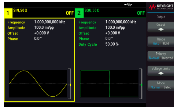
Figure 2. Dual-screen display of standard sine and square wave