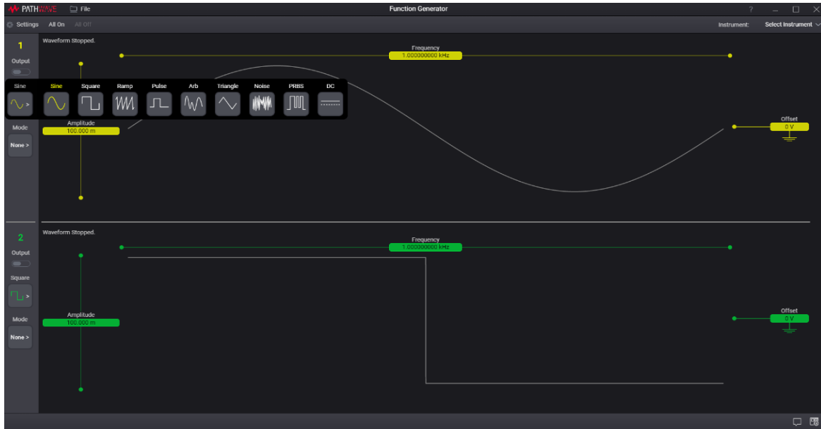
Figure 5. Select and configure your required waveform