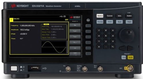
Keysight EDU33211A 20 MHz, single-channel function/arbitrary waveform generator