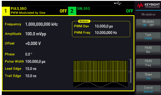
Figure 3. PWM modulated with standard sine wave