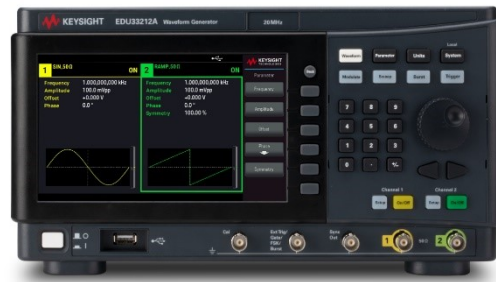
Keysight EDU33212A 20 MHz, dual-channel function/arbitrary waveform generator