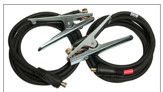
Current cables 2 x 5 m (16 ft), 35 mm<sup>2</sup>