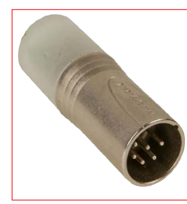
XLR Bluetooth dongle (BD-90011)