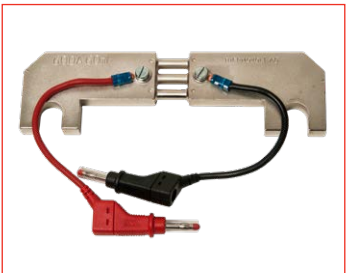
Calibration shunt, 600 A/60 mV (BB-90020)