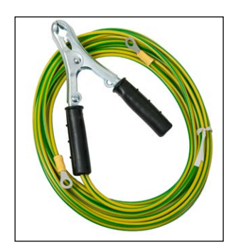
Ground cable, 5 m (16 ft) 2.5 mm<sup>2</sup>