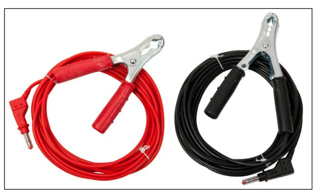
Sensing cables 2 x 5 m (16 ft)