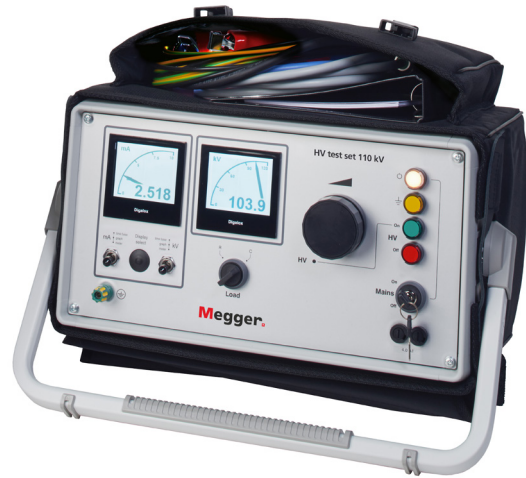
Analog and digital version of control unit HV test set 50/80/110/120 kV