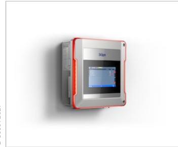
Dräger REGARD® 3000 in the event of a failure or fault